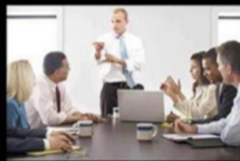
what my mom thinks I do