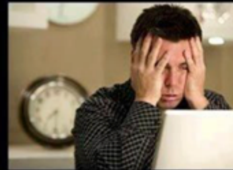
what I really do