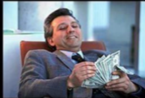
what customers think I do